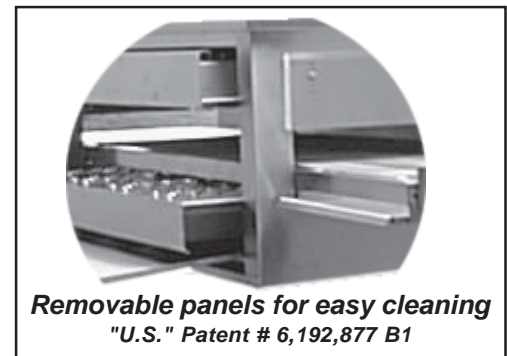
Removable panels for easy cleaning "U.S." Patent # 6,192,877 B1

Optional s/s stand 24" high with locking casters & bottom shelf available